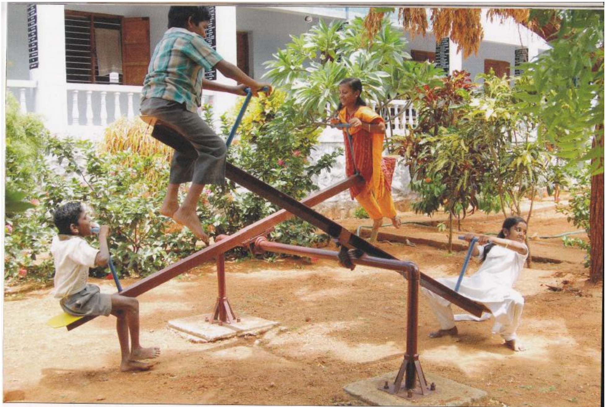
After School Fun Disabled children at Amar Seva Sangam enjoy play time after school, in the playground built by Handi-Care Intl. Children are engaged in various fun filled activities that help with their overall development. Our Canadian volunteers have contributed significantly in this aspect, by teaching them dance, music, painting, art work, board games and other engaging and stimulating activities.