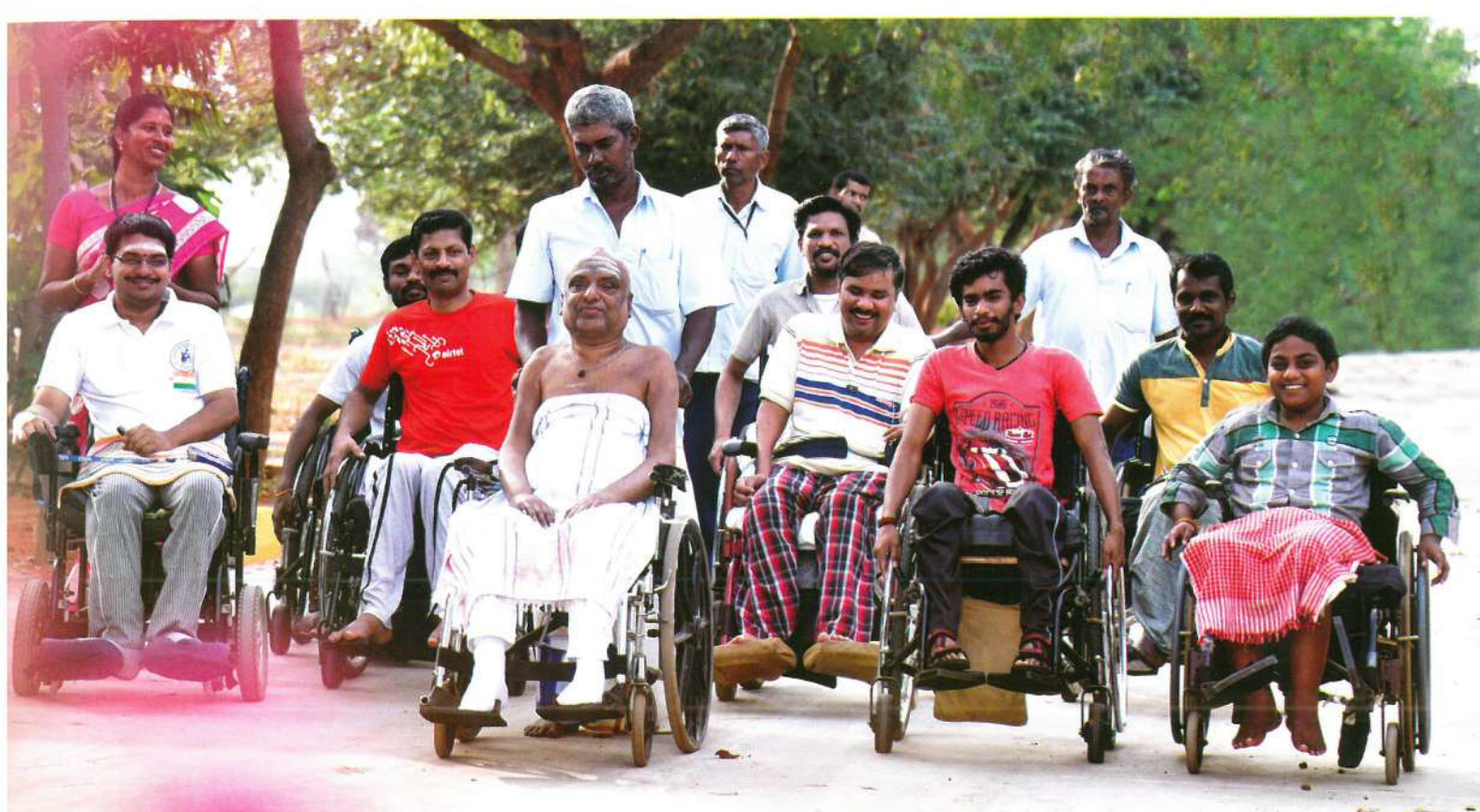
📷 Moving everyone forward in life