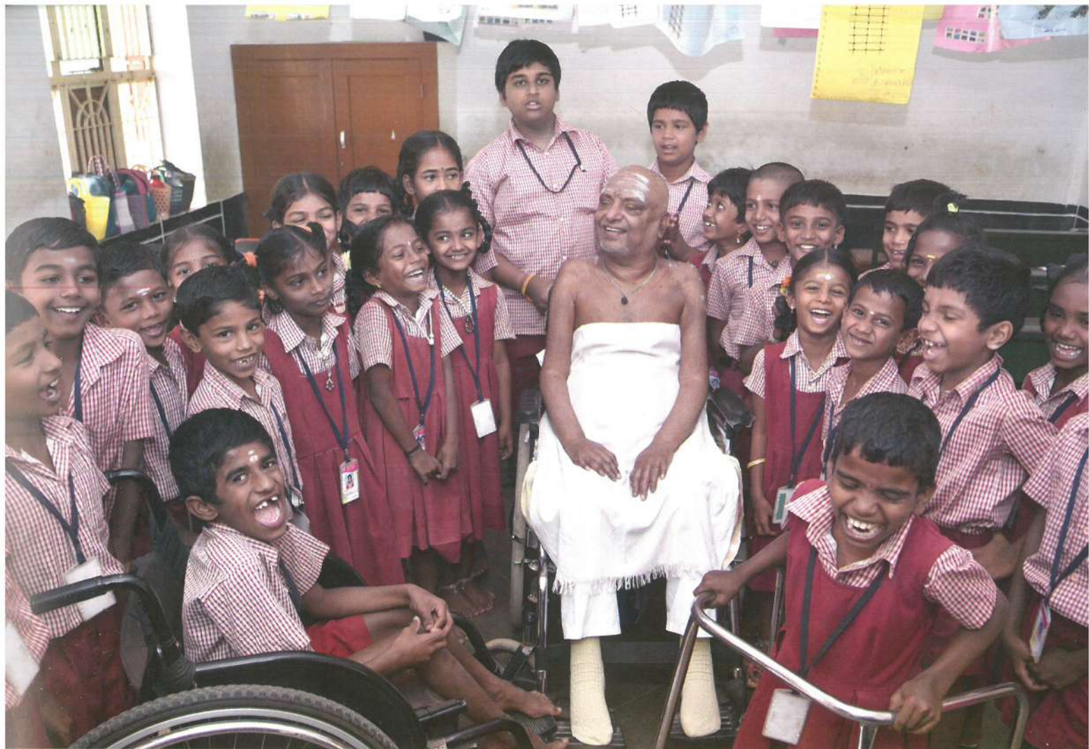
📷 Giving a new ray of hope